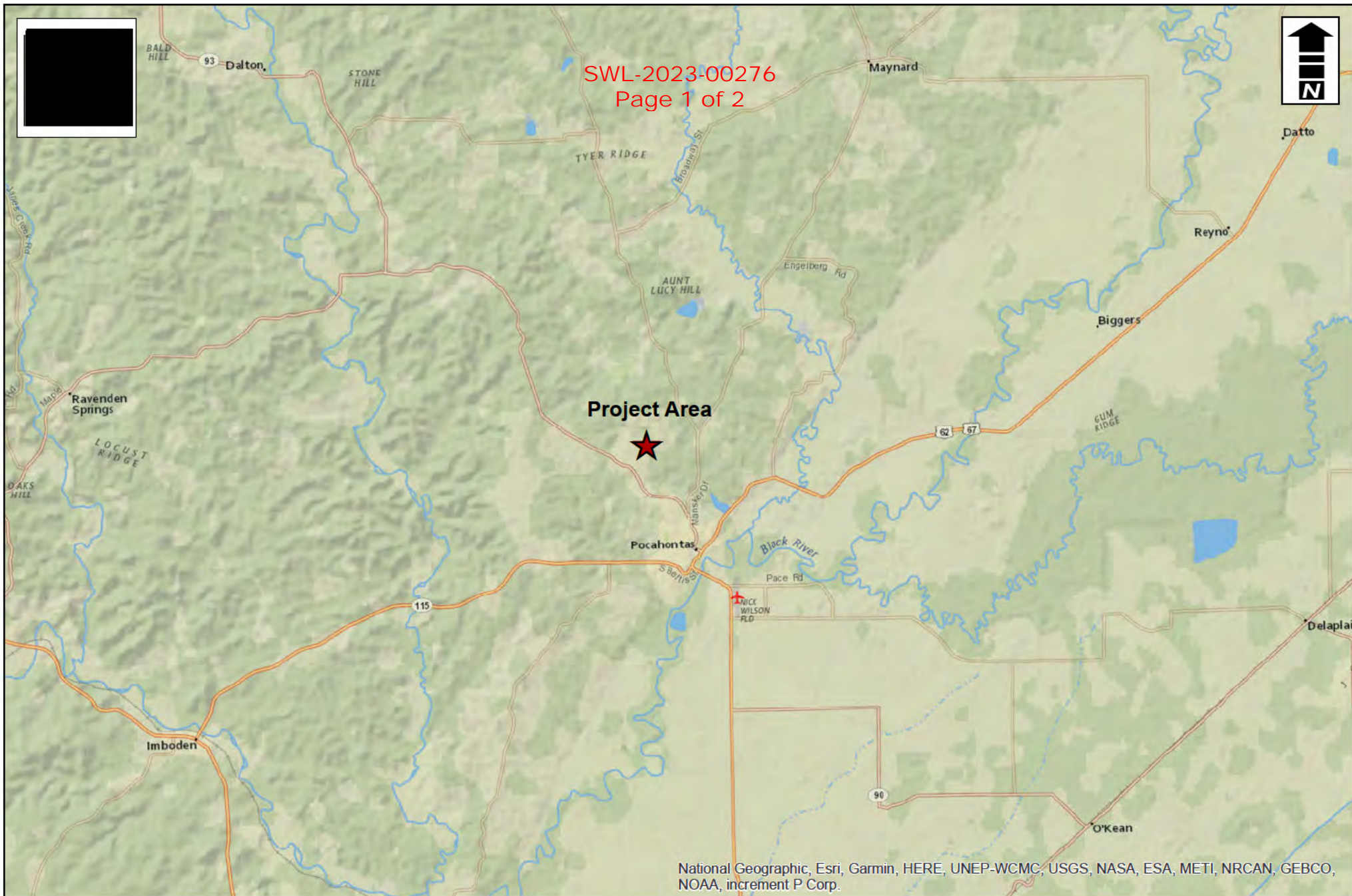
Figure 1: Vicinity Map